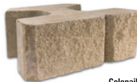
Colonial 6/16 Size: 6" H x 18" W x 12" D 150mm x 450mm x 300mm Weight: 60 lbs., 27 kg