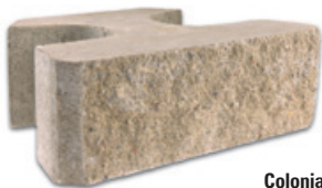
Colonial 18 Size: 6" H x 18" W x 12" D 150mm x 450mm x 300mm Weight: 60 lbs., 27 kg