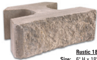
Rustic 18 Size: 6" H x 18" W x 12" D 150mm x 450mm x 300mm Weight: 60 lbs., 27 kg

Unit specifications, availability, color, and fascia options vary by manufacturer. Please contact your nearest Rockwood manufacturer or dealer for more information.