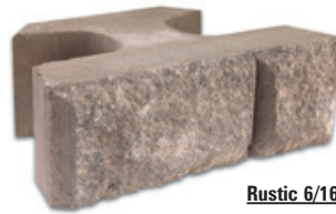
Rustic 6/16 Size: 6" H x 18" W x 12" D 150mm x 450mm x 300mm Weight: 60 lbs., 27 kg